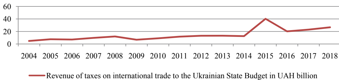
Fig. 3. Revenue of taxes on international trade in UAH billion to the Ukrainian State Budget in 2004—2017

Customs policy, in addition to influencing on the foreign trade sphere, also performs an important fiscal function for the state. The volume of tax revenues for international trade in the State Budget of Ukraine in 2004—2018 was analyzed (Fig. 3).