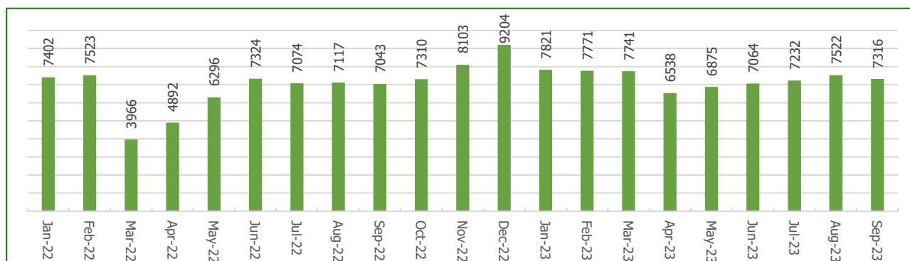
Figure 2. Imports of goods and services in 2022-2023, monthly, USD million. (Source: compiled by the author based on data from the Ministry of Economy of Ukraine)

The only group of goods that recorded a negative contribution to the dynamics of imports of goods was the goods in the aggregate group “Mineral Products” (Figure 2).